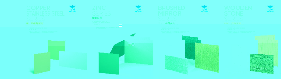
铜、不锈钢系列 镀锌系列 拉丝、镜面系列 木纹、石纹系列