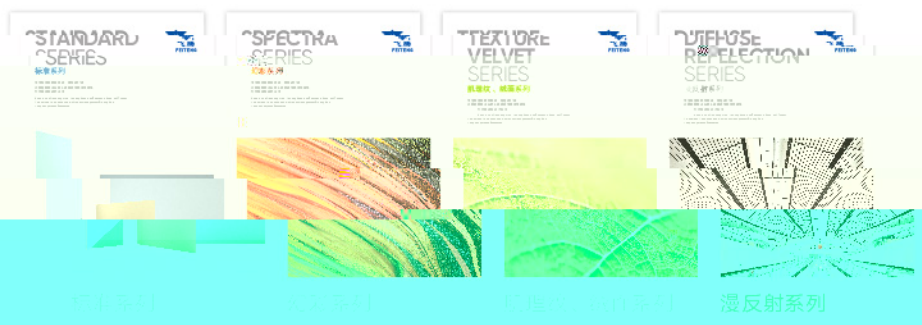
标准系列 光谱系列 纹理绒面系列 漫反射系列